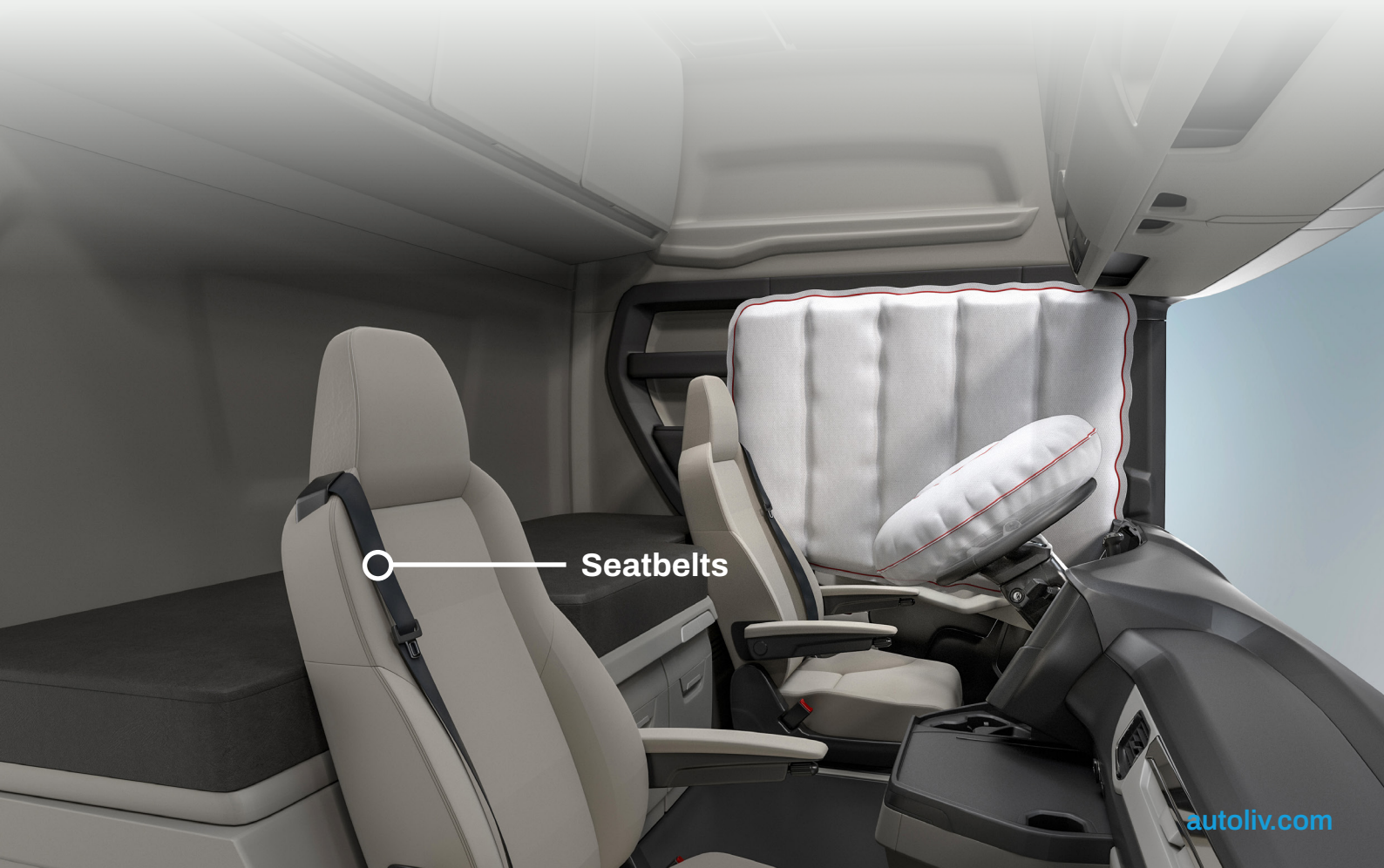
○ ——— Seatbelts